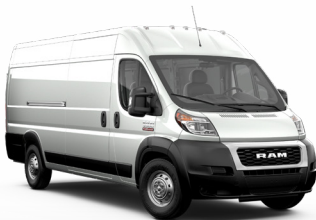
ProMaster 159" Extended WB