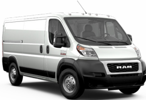
ProMaster 136" WB