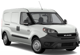
ProMaster City (122" WB)