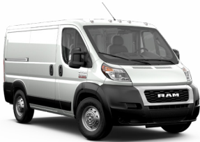
ProMaster 118" WB