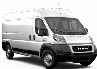
ProMaster 159" WB